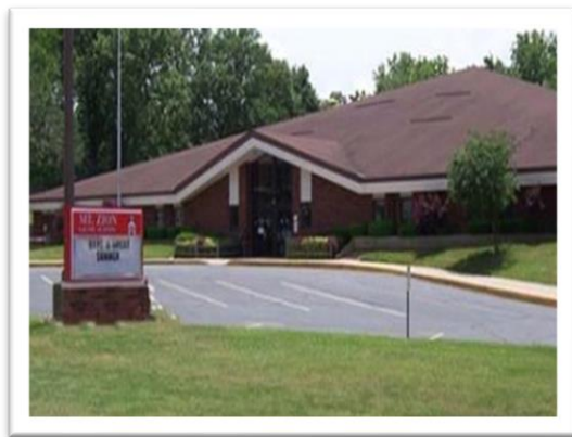
Mt. Zion Grade School "Mt. Zion Grade Rocks!"

Mt. Zion Grade School continues the tradition of high-quality education in a safe and nurturing environment. We appreciate your entrusting us with your child's education, and we certainly encourage the participation of parents and guardians in their child's education at both home and school. Open and honest communication serves each child best. Therefore, we will contact you if any concerns arise. Likewise, we ask that you feel free to contact us at 864-3631. We also enjoy visitors, so please plan to attend as many family events as possible, and please remember to sign in at the office as required. The staff of Mt. Zion Grade School looks forward to you and your child joining us. By working together, we can help ensure a productive and rewarding learning experience for all of the children at Mt. Zion Grade School!