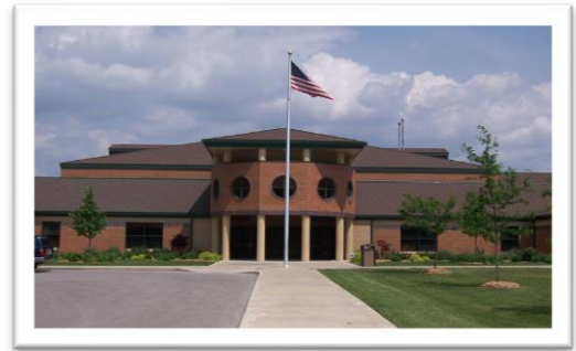
Mt. Zion Intermediate School: "Preparing students to be ready, responsible and respectful"

Also, if you arrive before 8 a.m., please do not wait in the drop off area. Please park in the main lot. Because of the volume of traffic before and after school, we ask that all vehicles work together to create a safe flow of traffic. For after school pick-up, please do not double park in the traffic lane. Also, please use the parking lot perimeter for circling the lot to move toward the student pick-up shelter. Additionally, please utilize the parking spaces for pick-up also, but remember to not wave a student over to you, as motioning to students to cross through the traffic to a parked vehicle has caused a few "near misses." Students have been directed to wait on the sidewalk until their vehicle pulls up and parks before entering the vehicle. Our goal is to provide a safe dismissal and student pick-up process. Thank you for your cooperation!