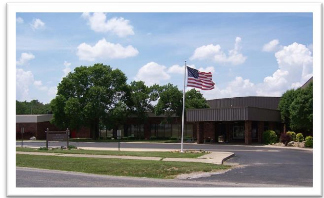
Mt. Zion Junior High School: "Home of pride, tradition, and spirit"

I trust the information in this publication will be helpful. If you have any additional questions, please call me at 864-2369.